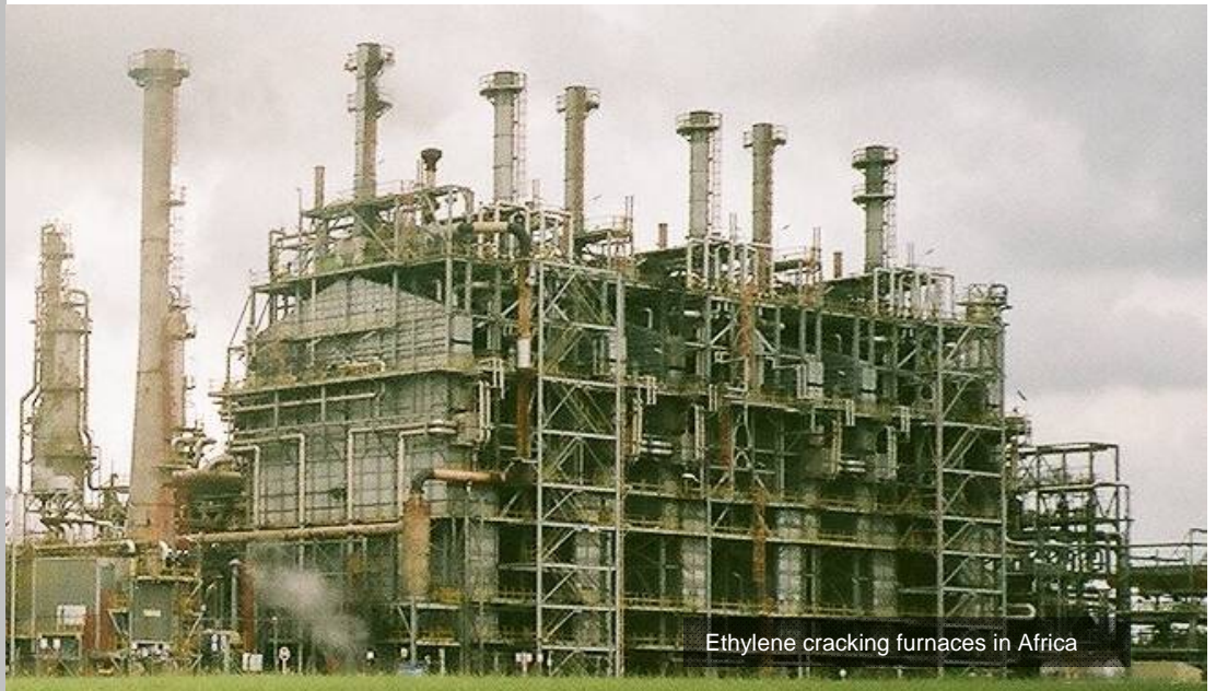
Ethylene cracking furnaces in Africa